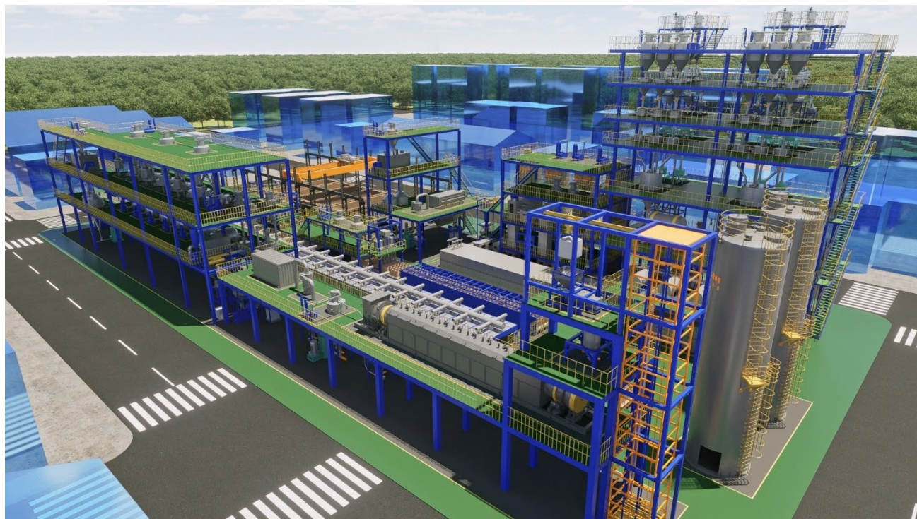
Figure 3: Illustration of Falcon's Coating Plant

Management's discussion and analysis for the year ended December 31, 2024