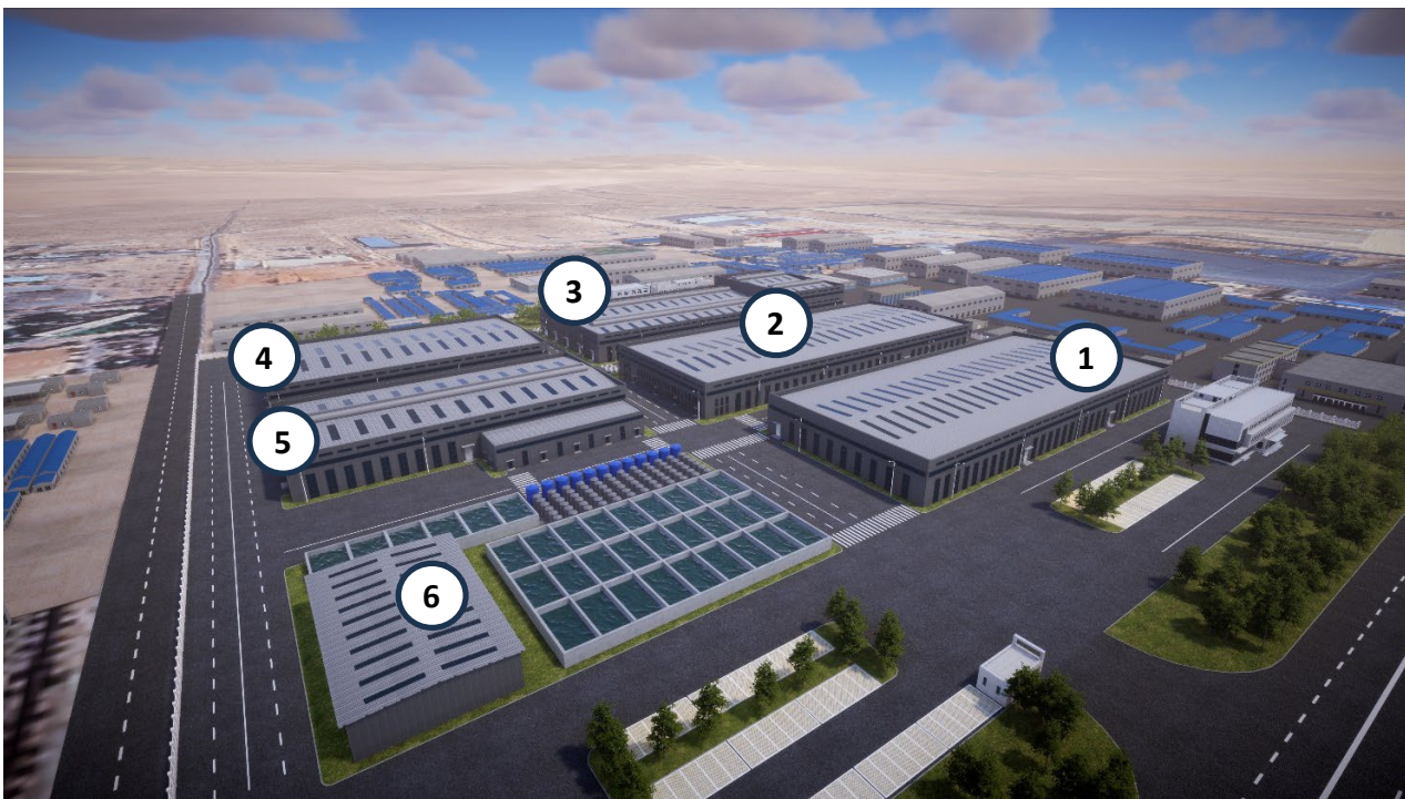
Figure 2: Illustration of Falcon's Morocco Anode Plant

Note: 1. Spheroidization plant; 2. Purification plant; 3. Coating plant; 4. Finishing plant ; 5. Acid storage; 6. Water purification.